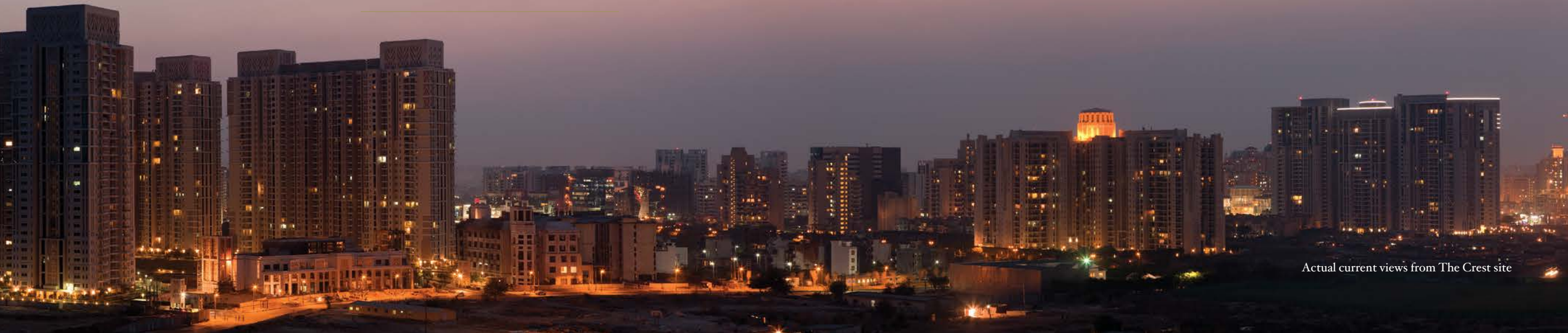
Actual current views from The Crest site

No matter which way you look, the view from your home at The Crest will be one to remember.