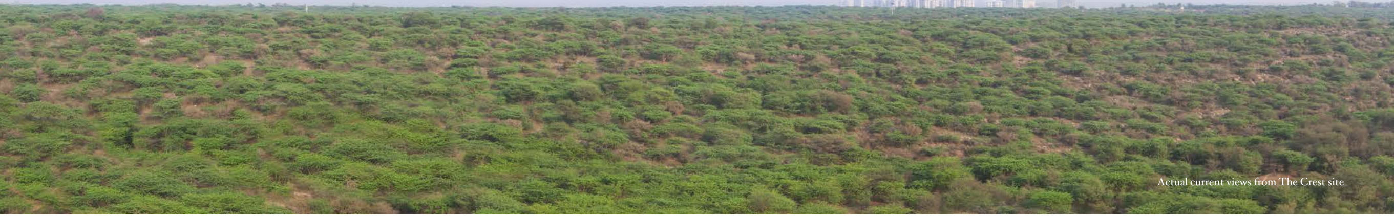
Actual current views from The Crest site