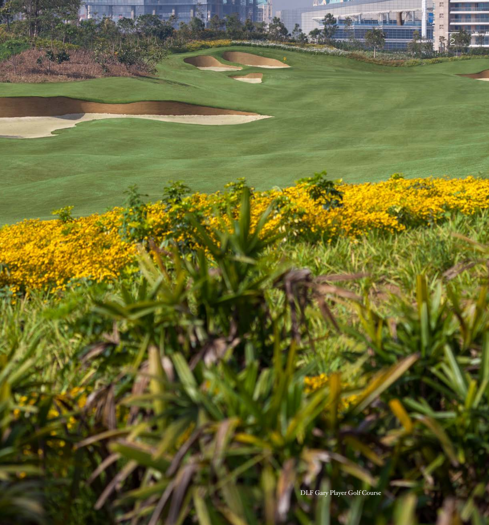
DLF Gary Player Golf Course