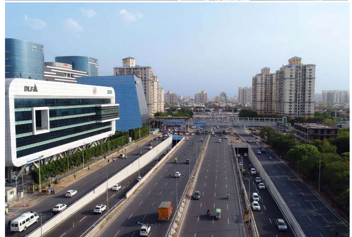
Raghvendra Marg (Erstwhile DLF Golf Course Road)